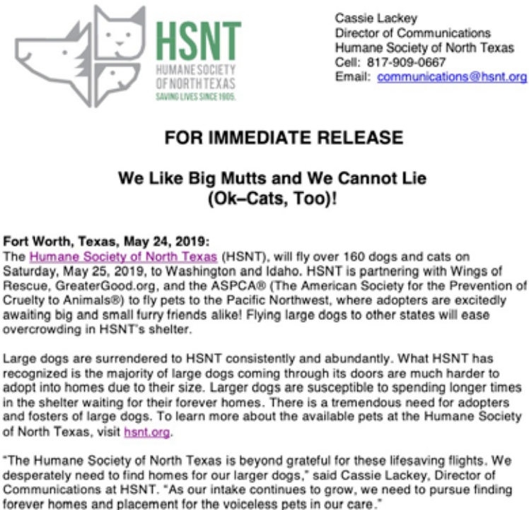
Figure 3. “We Like Big Mutts and We Cannot Lie (Ok-Cats, Too!)” press release was found by following the “Newsroom” link from hsnt.org. The release discusses a partnership with several organizations that will allow them to fly larger dogs to other states to be adopted, thus increasing rates of adoption.