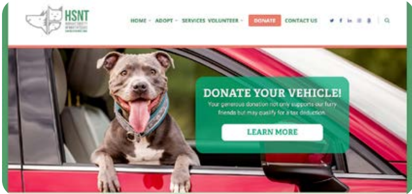
Figure 2. The Humane Society of North Texas homepage shows the organization’s logo, a basic navigational menu, and a photo of a large dog looking out a car window into the camera. Text next to the dog encourages viewers to donate their vehicle in support of the Humane Society.

When searching for “animal shelter,” you receive more than one billion results. You are now faced with a formidable evaluation task, but you can’t possibly look at all of these sources. You could choose to narrow your search terms to something like “animal shelters and lost pets” (which yields 66,200,000 results) or take Google’s apparent suggestion and focus your search on animal shelters in your local area. Let’s say you decide to focus on the Humane Society of North Texas, the first result from your original search (see figure 2).