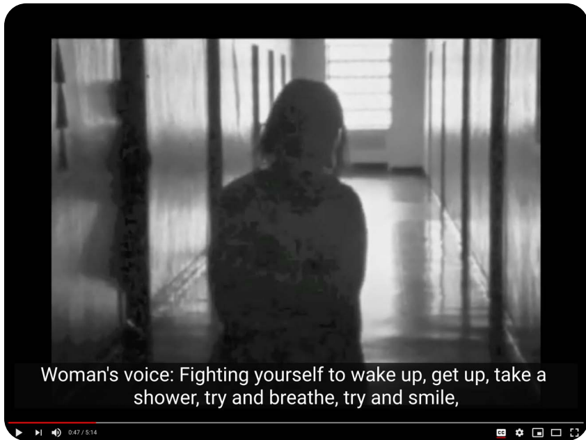
Figure 2. “A College Collage” by Evan Kennedy on YouTube. Evan reinforces the use of spoken words with an image of a woman. Text reads “Woman’s voice: Fighting yourself to wake up, get up, take a shower, try and breathe, try and smile.” Please access Evan’s video at https://youtu.be/RgX4U7Z25c0 .

listen for more images, words, and sounds to help me better understand the message.