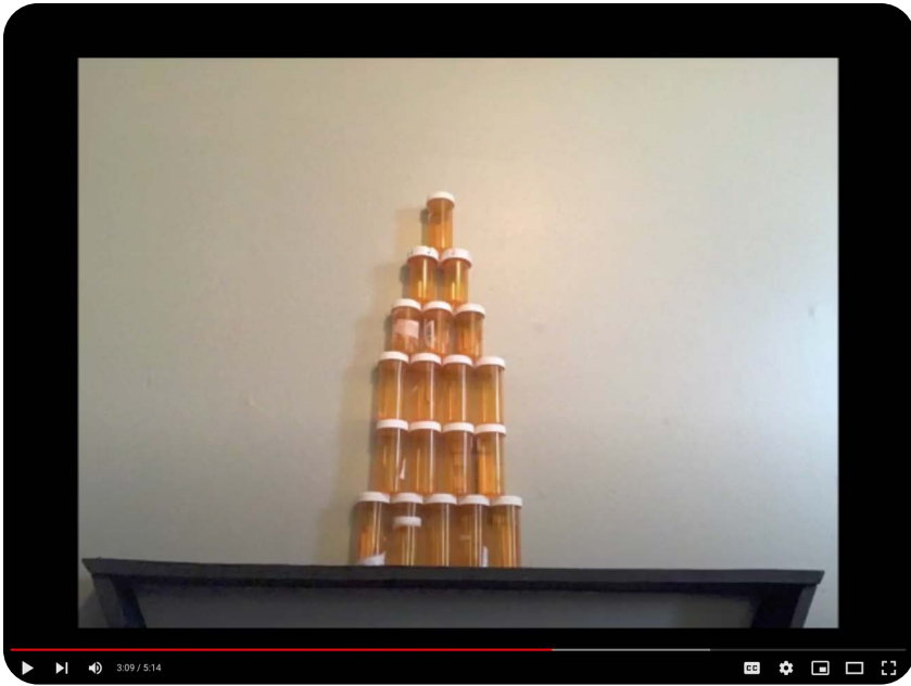
Figure 1. “A College Collage” by Evan Kennedy on YouTube, showing an image of stacked pill bottles. Please access Evan’s video at https://youtu.be/RgX4U7Z25c0 .

Evan effectively uses reinforcement in this opening sequence with the sounds and images. The excerpt from 0:44-0:51 is a good example. A female voice speaks, saying, “Fighting yourself to wake up, get up, take a shower, try and breathe, try and smile, try and act like you believe you have something to live for.” Through words, the speaker describes one kind of daily mental health struggle, and reinforcing this spoken message is the image sequence that Evan chose to put with it: a female figure, shadowed, who walks slowly toward us down a hall (see Figure 2). But the image sequence doesn’t exactly double the content of the spoken words; it adds a feel and tone, along with more information that allows us to interpret the words. The visual is dark, shadowy, somber. We can’t see the woman’s face. We imagine her struggle to “wake up, get up” as she teeters down the hospital hallway. Together, the words and the image help to communicate the message: that for this woman, it’s difficult to wake up and start the day.